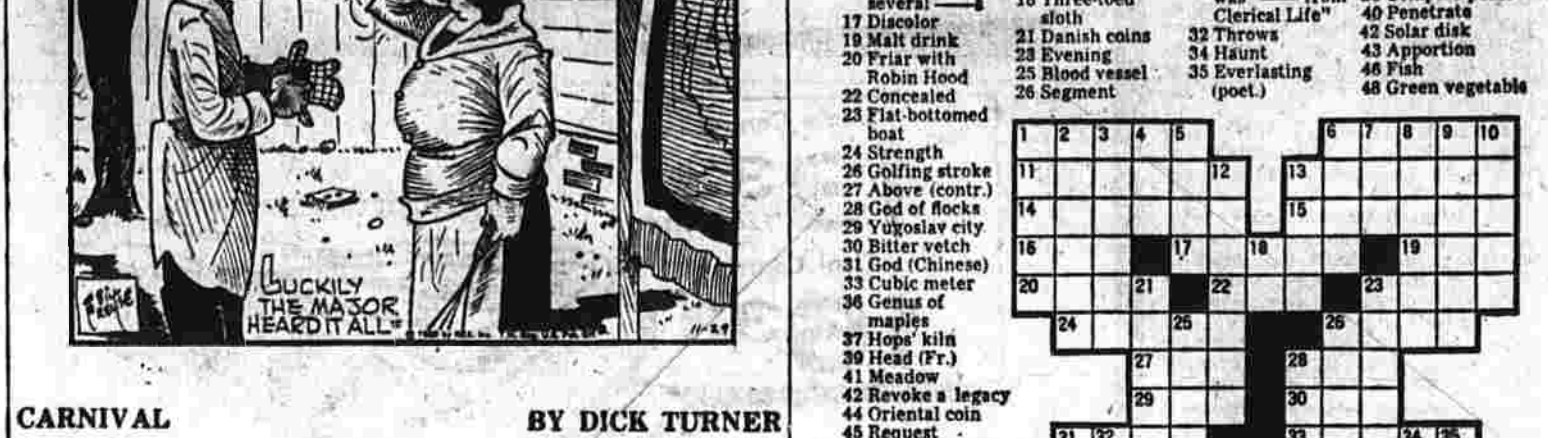
BY DICK TURNER