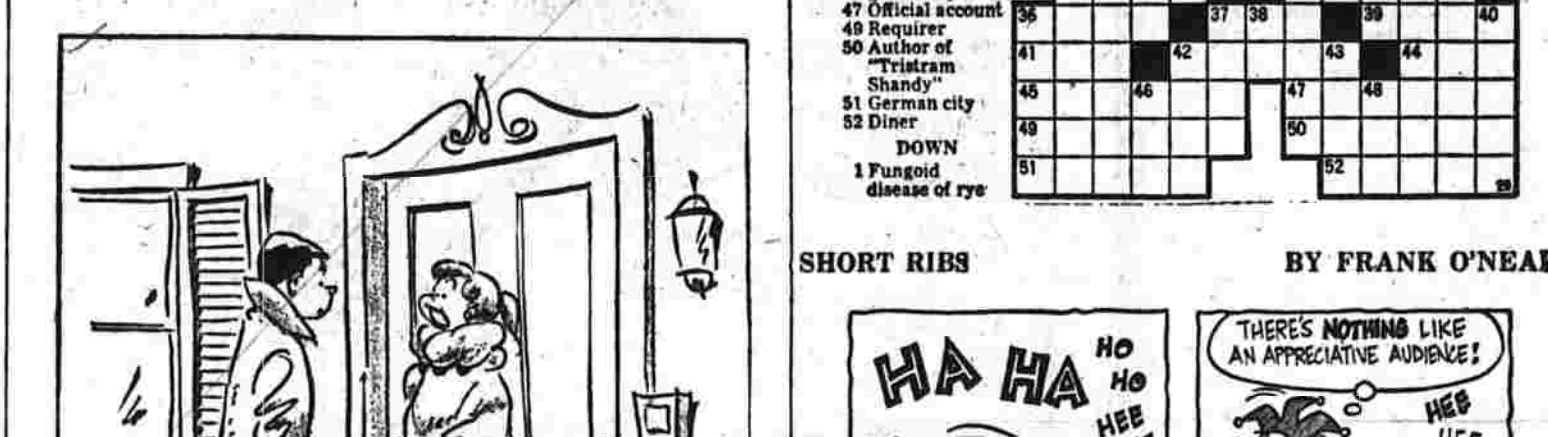
BY FRANK O'NEAL