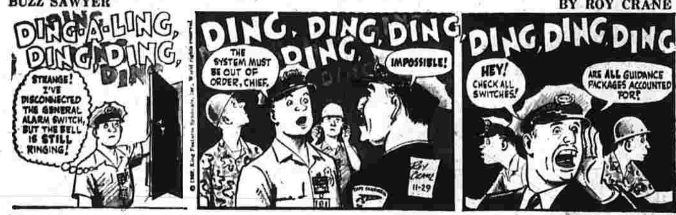
BY ROY CRANE