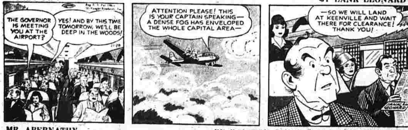
BY LANK LEONARD