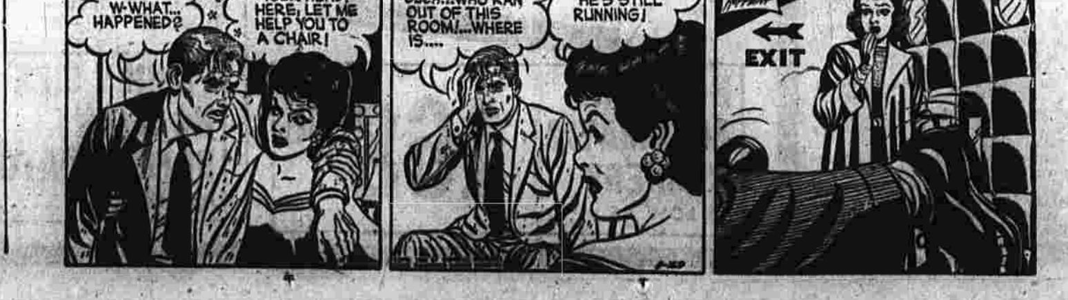
BY JEFF COBB