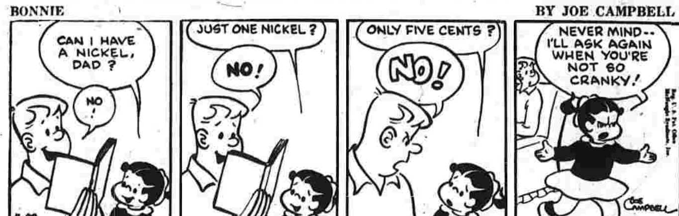
BY JO CAMPBELL