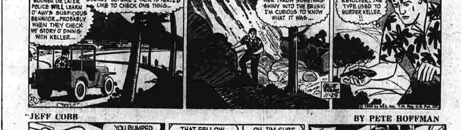
BY PETE HOFFMAN