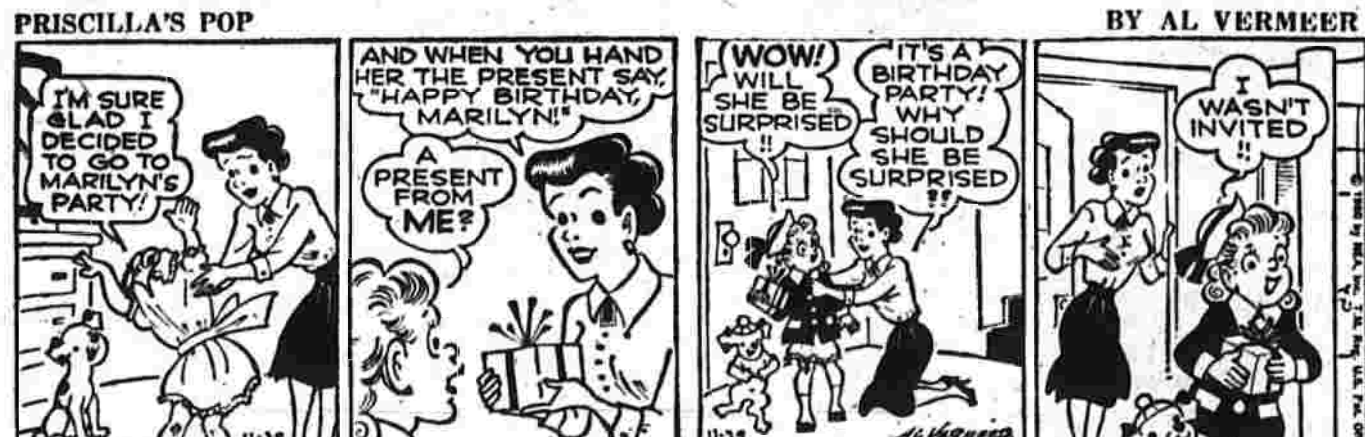
BY AL VERMEER