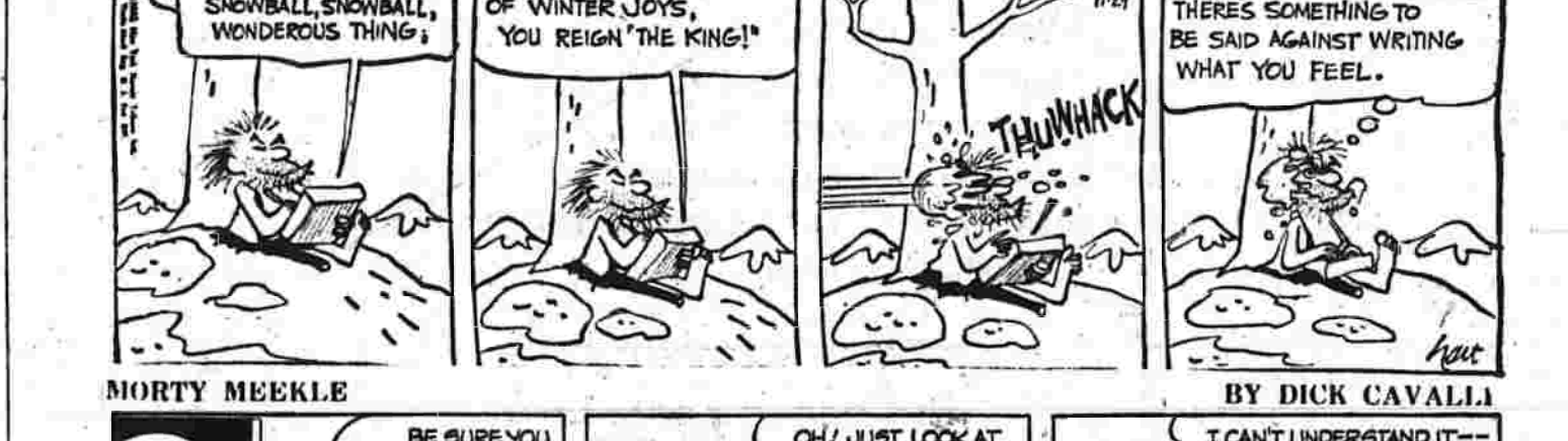
BY DICK CAVALLI